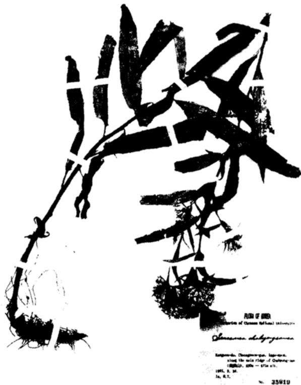
Plate 1. Type specimen of Saussurea chabyoungsanica Im.

interiores oblongo-lineares apice acuminatae. Corolla purpurascens 8 mm longa, pars angusta tubi 4 mm longa, pars cetera 4 mm longa. Pappus brunescens,